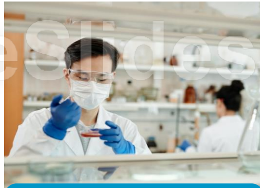
Dr. Lorem Ispum Heart and Stroke