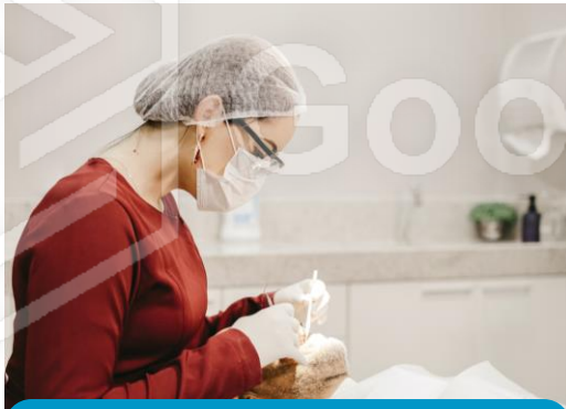
Dr. Lorem Ispum Virology Specialist

Lorem ipsum dolor sit amet, conse lectus ornare, viverra ctetur adipiscing elit.