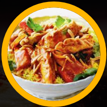
Butter Chicken with turmeric rice