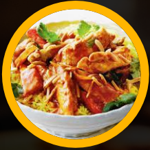
Butter Chicken with turmeric rice