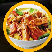
Butter Chicken with turmeric rice