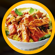
Butter Chicken with turmeric rice