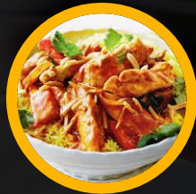
Butter Chicken with turmeric rice