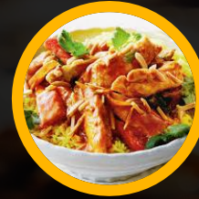
Butter Chicken with turmeric rice